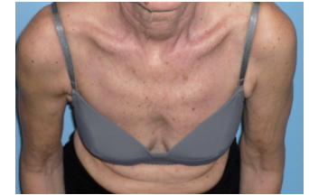
Same patient wearing MAGIC bra prototype